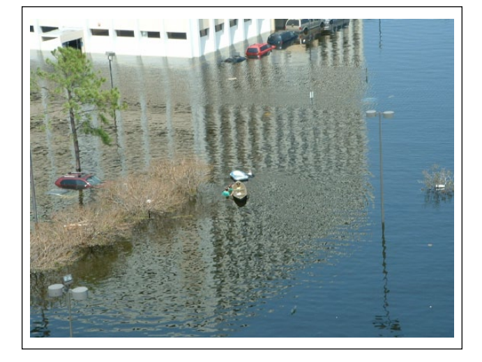
Figure 3. "Water, water everywhere nor any drop to drink." (Samuel Taylor Coleridge, "The Rime of the Ancient Mariner") Heroic journey of engineering department representatives through snake-infested waters from hospital to office building with hopes of retrieving bottled water on August 31, 2005.

By Wednesday, August 31, no one was aware of how long food and water supplies would be needed, so the food and nutrition team were planning for supplies to last up to 10 days. Several members of our engineering department braved the chest-deep, water moccasin-infested waters through the parking lot to the Medical Center of East New Orleans (MCENO) office building (Figure 3). They were able to enter the various offices with a pass key and retrieved twenty 5-gallon bottles of water usually present in physician offices' water dispenser/ coolers to ensure that all water supplies would last 10 days as well. These were transported via a small boat and stored in the command center/administration office, which became the site of water rationing amid temperatures above 100°F and humidity (Figure 4). While at MCENO, they discovered a very elderly woman in the lobby. She had evidently been there for days alone. She was in surprisingly good condition and was very complimentary of her ration of canned vegetable soup.