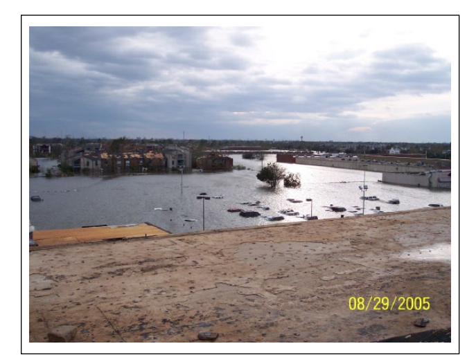
Figure 1. Methodist Hospital—view from fourth floor patio/ roof. Back parking lot facing west-northwest toward downtown New Orleans and Lake Pontchartrain (right). This is also the area where an 11-foot alligator was observed having a leisurely swim later in the week.

mandatory evacuation of the city with the exclusion of hospitals and nursing homes, negating any chance to evacuate Methodist Hospital. Following landfall on the early morning of Monday, August 29, 2005, the hospital had approximately 760 individuals under its leaky roofs and between its imploded windows. Approximately 170 patients were part of the group that also included 19 physicians, hospital staff and some of their families, and patients' families. In addition, the hospital housed a cadre of others who took refuge in the hospital before and after flooding, which resulted in the hospital becoming an