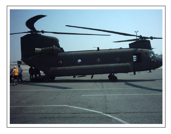
Figure 11. An aircraft sent to the hospital to evacuate patients, staff, and others stranded at the hospital.

1. Include disaster preparedness measures in the NST policy and procedure manual and/or develop a standalone policy.