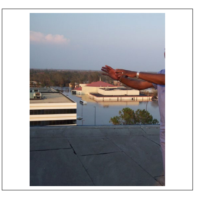
Figure 8. Behavioral health nurse's arms help direct helicopter roof landing. Note surrounding flooded area.

The work that the core NST members, who were not at the hospital, had previously performed in educating and raising awareness of nutrition support in hospital and medical staff alike was reflected in the actions of those who remained in the hospital during Katrina. One of the precepts embraced by the Methodist NST was that of transdisciplinarity. The team